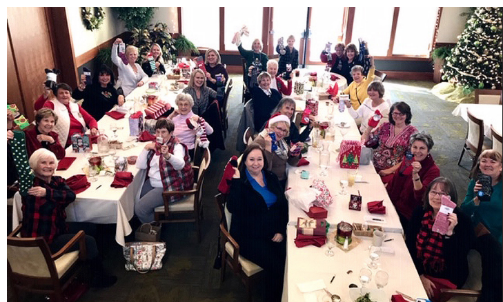
Shadow Hills Women's Day Continues in the Winter with Women's Winter Golf Every Wednesday 9am Start Go to ForeTees to Sign Up