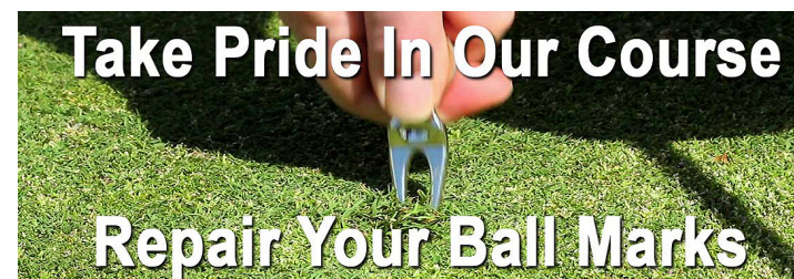
Take Pride In Our Course

Once again, thank you for making Shadow Hills a great place to Come to work every day! Happy New Year and See you at the club!