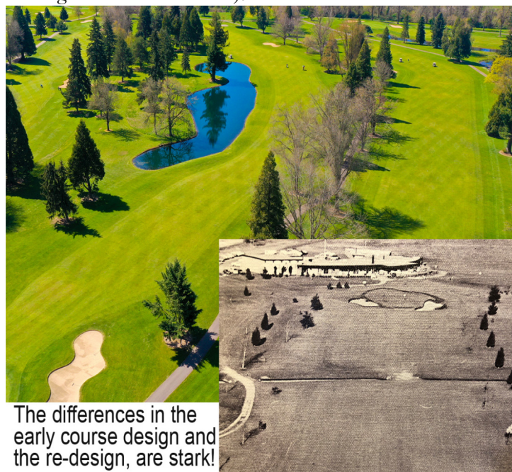
The differences in the early course design and the re-design, are stark!

The redesign took place 30 years after Shadow Hills opened, in four stages, between 1992, and 1995, and led to an infusion of new members. Three years after the redesign was completed, Shadow Hills hosted its first Oregon Classic, part of the Nationwide Tour. This event became a Pacific Northwest golf highlight for ten years, 1999 – 2008, and saw some of the greatest modern-day players pass through on their way to the PGA tour. (Check out the signed posters in the hallway leading to the locker rooms).